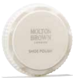
Shoe Polish (Resealable)