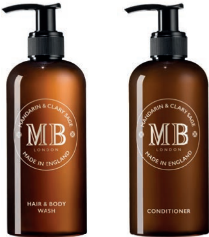
Hair & Body Wash Conditioner