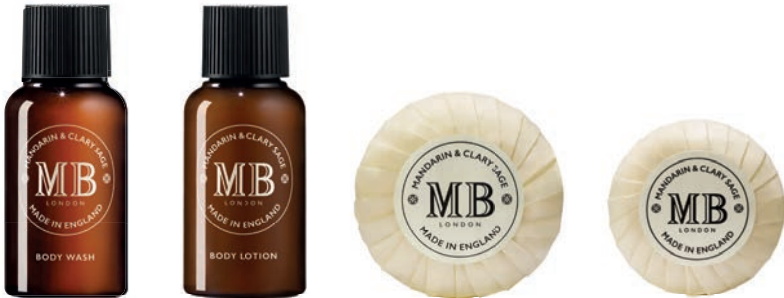
Body Wash Body Lotion 50g Soap 30g Soap