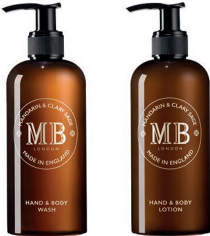
Hand & Body Wash Hand & Body Lotion

Available in 30ml (1fl oz) and 50ml (1.7fl oz)